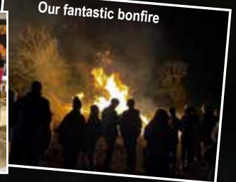
Our fantastic bonfire

Thanks to our sponsors for their support