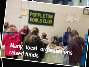
Many local organisations raised funds