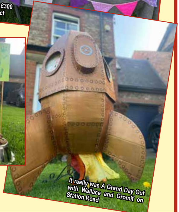
It really was A Grand Day Out with Wallace and Gromit on Station Road