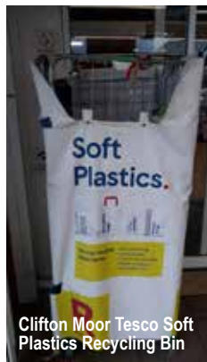
Clifton Moor Tesco Soft Plastics Recycling Bin