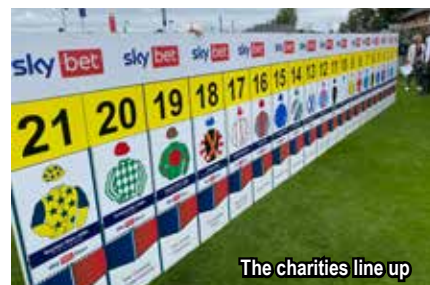
The charities line up

Readers may recall that in the last issue we reported that we had been allocated a horse in the Sky Bet Ebor Festival Community Sweepstake with a potential to win £20,000 for the Out o' Space project. Well, our horse was scratched at the last minute and our replacement, Get Shirty, didn't manage to win. However, we were still awarded £1,000 and, as they say, never look a gifthorse (or even a racehorse) in the mouth.