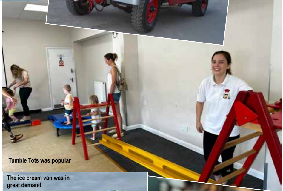
Tumble Tots was popular