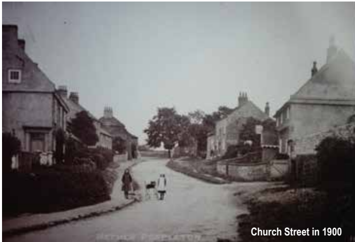
Church Street in 1900

The two village communities of Nether and Upper Poppleton used to be small independent villages which were separated by orchards and farming land. In the 1960s and early 1970s, extensive house building took place between the two communities which effectively created one large village.