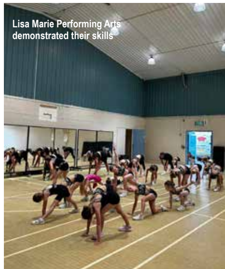
Lisa Marie Performing Arts demonstrated their skills