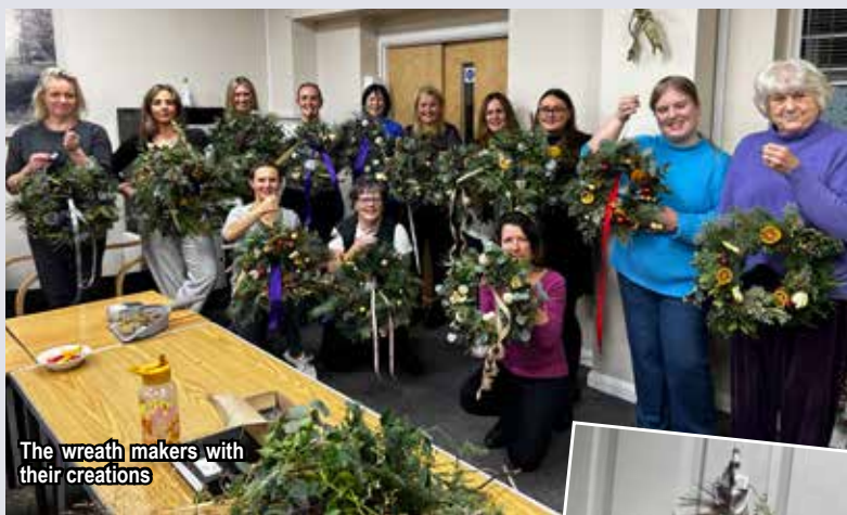
The wreath makers with their creations