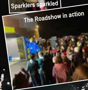
The Roadshow in action