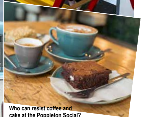
Who can resist coffee and cake at the Poppleton Social?