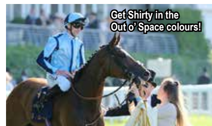
Get Shirty in the Out o' Space colours!

Readers may recall that in the last issue we reported that we had been allocated a horse in the Sky Bet Ebor Festival Community Sweepstake with a potential to win £20,000 for the Out o' Space project. Well, our horse was scratched at the last minute and our replacement, Get Shirty, didn't manage to win. However, we were still awarded £1,000 and, as they say, never look a gifthorse (or even a racehorse) in the mouth.