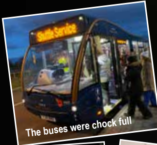
The buses were chock full

Bonfire Night is a truly community affair helping to raise funds not only for The Centre but for many other local organisations and it wouldn't be possible without the enormous amount of time and effort put in not only by the Centre team and Trustees but a host of other volunteers - so a huge 'Thank You' to all of them, and to everyone who came along for a great night out and to support the community centre.