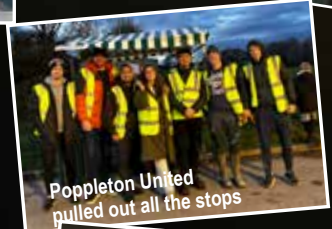
Poppleton United pulled out all the stops