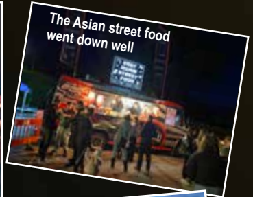
The Asian street food went down well