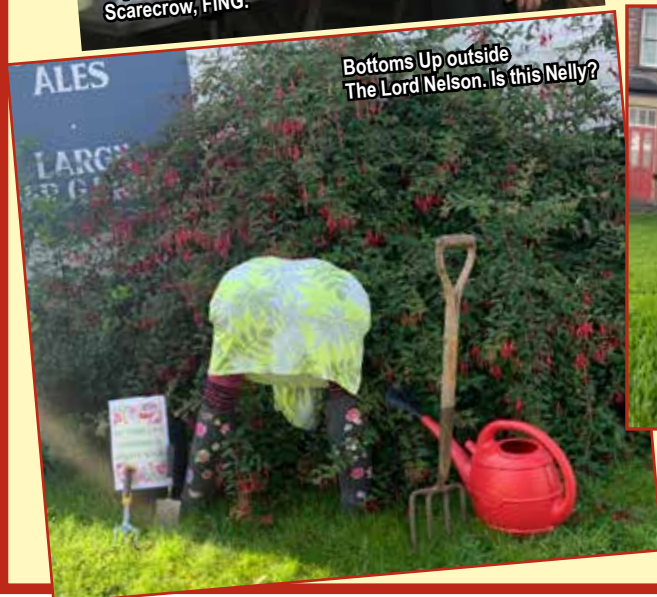
Bottoms Up outside The Lord Nelson. Is this Nelly?