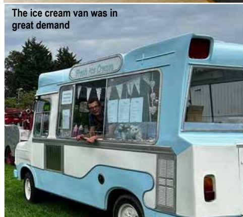
The ice cream van was in great demand