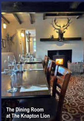
The Dining Room at The Knapton Lion