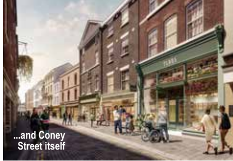
...and Coney Street itself