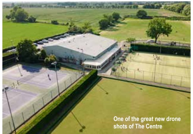
One of the great new drone shots of The Centre

Please contact Nicola for more information/to book on 07773 397 967 or stoppsn@hotmail.com