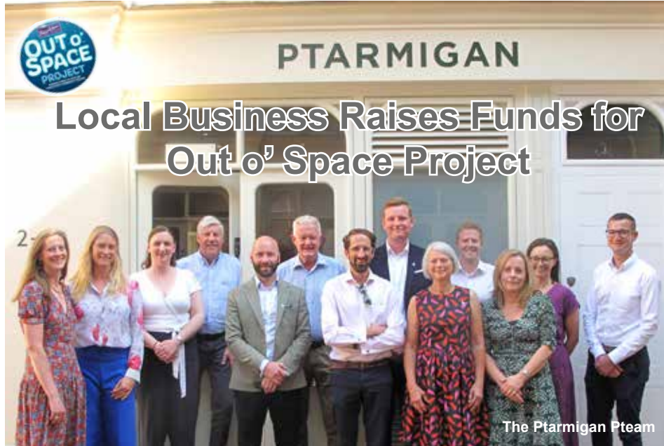
The Ptarmigan Pteam

sores walk to raise funds for the project (see below); York based property investment company Helmsley Group have made a substantial donation and offers of assistance; a bid to the Sky Bet Ebor Festival Community Sweepstake will bring us additional funds (just how much should be known by the time you read this-it could be as much as £20,000!) and Hudson Moody have agreed to be a sponsor of the Centre Bonfire and Firework Spectacular enabling us to generate extra income from the event.