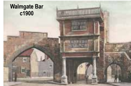
Walmgate Bar c1900

Colliergate was a narrow street with Christ Church an obstruction together with the Haymarket. With maybe 1000 horses in and around York every day hay was essential. Later the Haymarket was moved to Peasholme Green but it still obstructed traffic. The death of a lad taking his aunt to church on Christmas Day was recorded after he lost control of his borrowed gig.