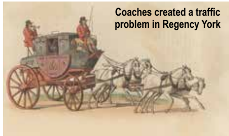
Coaches created a traffic problem in Regency York

St Helen's Square was the 'transport hub' with coach traffic generated by York Tavern; 15 departures per day. Other local Coaching Inns added business. The circuit: Coney Street – Lendal – Museum Street – Duncombe Place – Petergate – Stonebow – High Ousegate – Coney Street was York's first Inner Ring Road, linking the radial exit roads via the bars of Bootham, Monkgate, Walmgate and Micklegate.