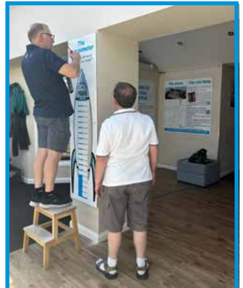
The Spaceometer goes up in Reception, recording our fundraising success. We'll soon be able to add another £25,000. Keep watching!