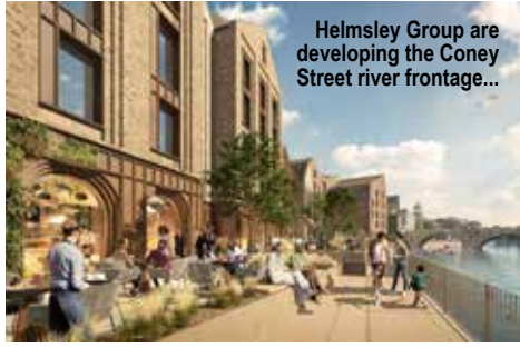
Helmsley Group are developing the Coney Street river frontage...