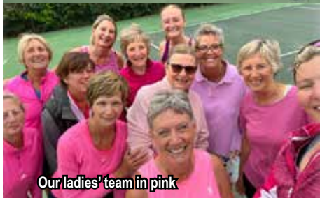
Our ladies' team in pink