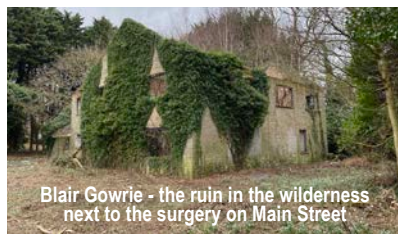
Blair Gowrie - the ruin in the wilderness next to the surgery on Main Street

The Greens Group of the Council have tabled a proposal to build a pond on Chantry Green. The Council decided it should go to a public consultation and a public meeting is to be held on Sunday March 26th at 11.30am at The Poppleton Centre. Full details are on page 9.