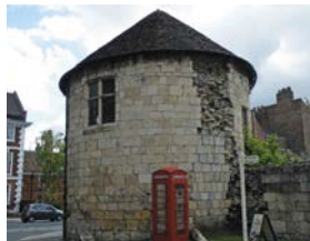
St Mary's Tower

The speaker matched the chronology of events in 1644 with maps and images. York Castle was held by the Royalists but besieged by 3