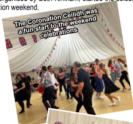
The Coronation Ceilidh was a fun start to the weekend celebrations