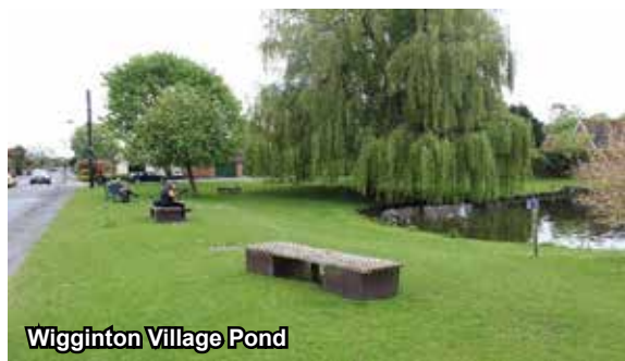
Wigginton Village Pond

Upper Poppleton Parish Council recently initiated a project to investigate the possibility of creating a new village pond on Chantry Green. Following a public meeting