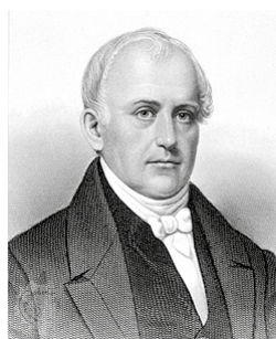
Samuel Slater made his fortune in Massachusetts

Jedediah Strutt using the water frame pioneered by Richard Arkwright at Cromford Mill. When his father died in 1782 his family indentured him to Strutt and when he reached 21 years he was well experienced. Tempted to America he knew that it was against the law to export designs and so memorised as much as he could, departing abroad in 1789. Hence the name given, 'Slater the Traitor'.