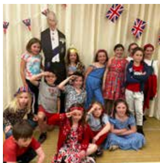
The Ceilidh was a great family party

In case you've forgotten, the beginning of May was hit by Coronation fever and Poppleton par- tied as only Poppleton can - at The Centre, on The Green and at home. It was fantastic to see