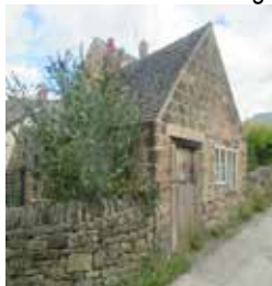
The Old Nailshop in Joseph Street, Belper