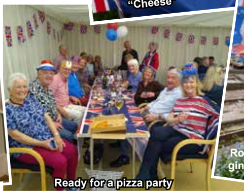
Ready for a pizza party