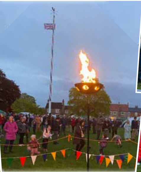
The White Horse provided food. The Beacon and Les Vaughan's Jubilee Band rounded off the evening.