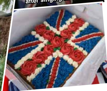
Bethany Rackham's coronation funfetti cake from the Pear Tree Avenue street party!