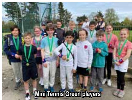
Mini Tennis Green players

On Sunday April 16th Poppleton hosted the York mini tennis league. Teams from Poppleton, David Lloyd York, Pocklington, Fulford and Wigginton competed in Red U8, Orange U9 and Green U10. 40 players took part and had a great time.